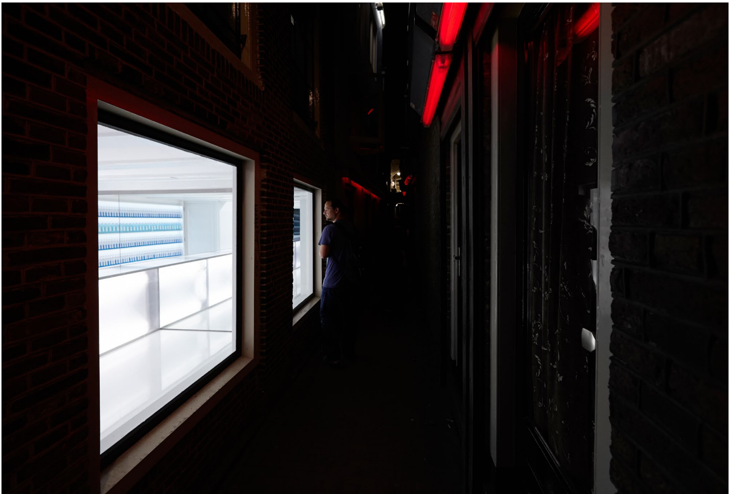
View from outside